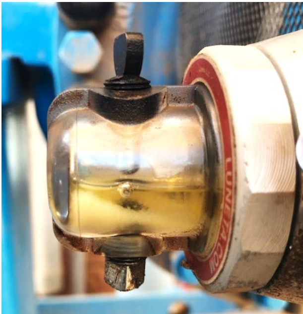
A mysterious white substance is being indicated by the Condition Monitoring Pod at a water reclamation facility in Arizona.

A machine's lubricant is a fantastic source of information about what's going on inside your machine. The CMP harnesses this power by offering the lubricant technician a variety of simple inspection tools, most of which only require the naked eye. These tools make it possible for failures to be detected before they become catastrophic. Sometimes these failures are not lubricant related (misalignment, for instance) but evidence that failure is occurring and can be readily observed through inspection of the CMP.