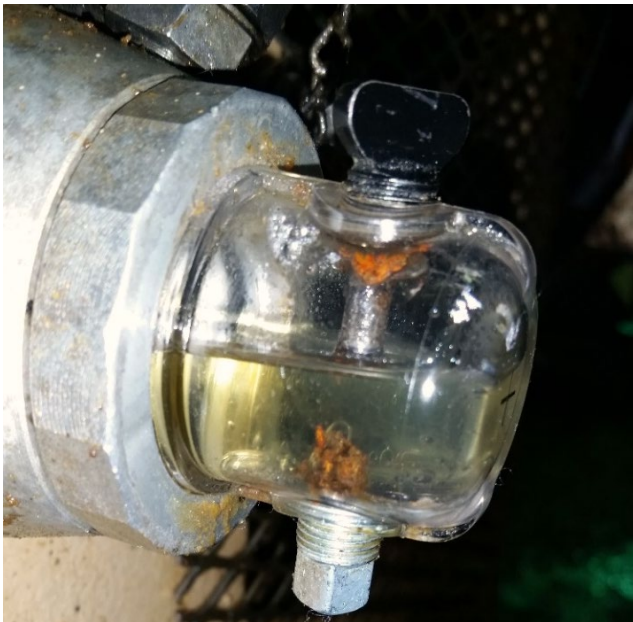
This CMP at a food processing plant is indicating water contamination. Notice the rust on the steel corrosion indicator at the top of the sight glass. Fluctuations in oil level have caused some of the rust to break off and be captured by the magnet below.

A rusted steel indicator is an alarm that water is present and that the risk of corrosion inside your machine is very high.