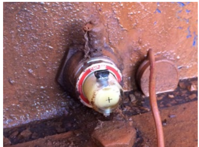
This CMP Sight Glass on a gearbox at a mine is indicating air contamination by foam on the surface of the oil.

Air can change the properties of a lubricant and is a common major or contributing cause of machine failure. Air can contaminate a lubricant many ways, such as through the suction side of a pump or a leaking seal. And, like water, air takes many forms: dissolved, entrained, free, or as foam on the surface. Air accelerates the rate of oil degradation, changes the oil's ability to transfer heat, contributes to pump cavitation, and can cause erratic operation of hydraulic systems. Foam on the surface of the oil can also alter oil levels and make level observations through a sight glass difficult.