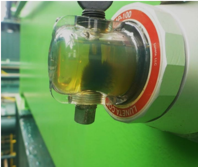
The CMP in this photo is on an ocean dredging vessel and is displaying a collection of wear debris on its magnetic plug.

Wear particles signify that surfaces within a machine have begun to break down. Small amounts of wear debris are common in many machine oils; however, when a lubricant begins to fail, the rate of wear debris generation typically increases, and machine failure becomes more likely. The sooner a change in wear debris production is detected, the more likely machine failure can be prevented.